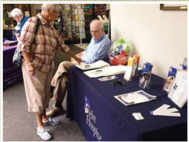
Stein Hospice staff at Erie County Senior Center Health Fair