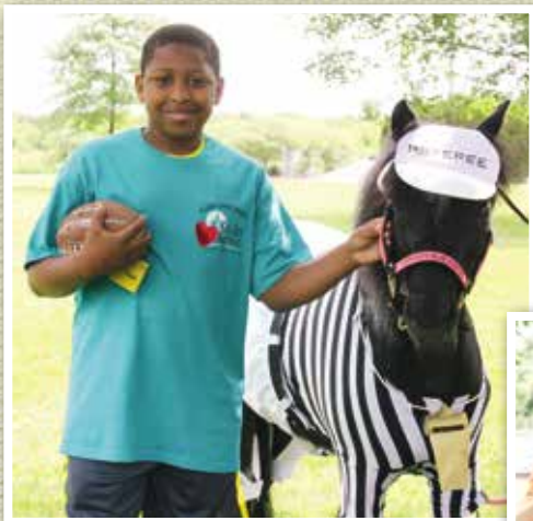
Coach has words with ref.