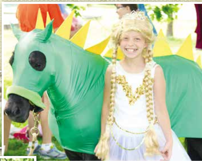
Diamond the "dragon" brightens a princess's day.