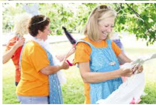
Volunteers prep for Dress-up Day.