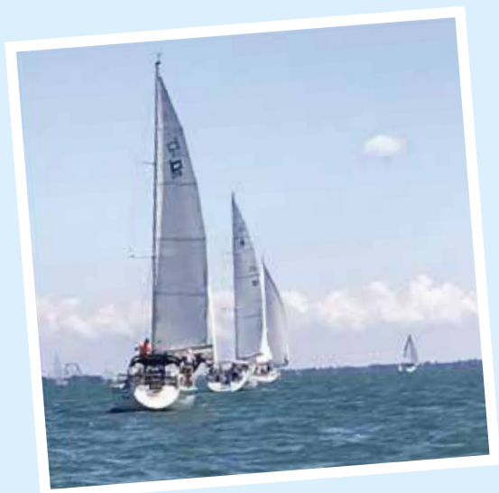
At mid-race the competition is close.