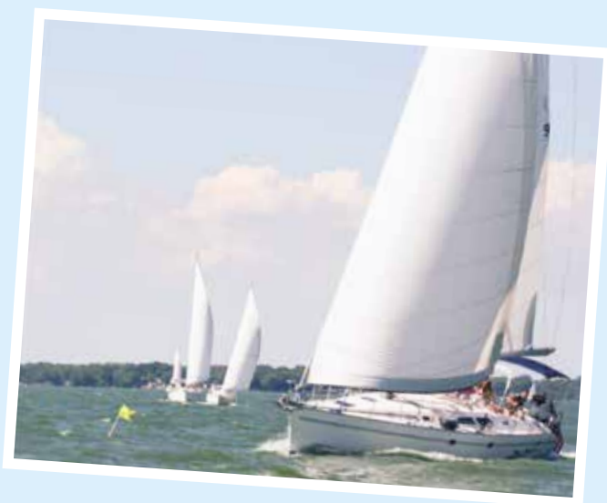
True North crosses the finish line first.