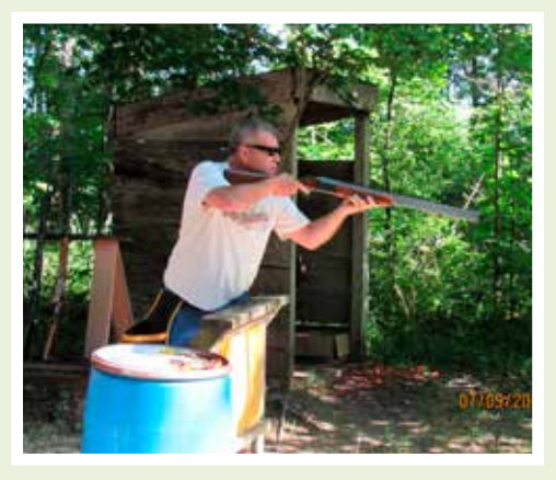
Sporting Clay Shoot W.R. Hunt Club – July 14