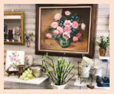
TUESDAY 20% off framed artwork and lamps