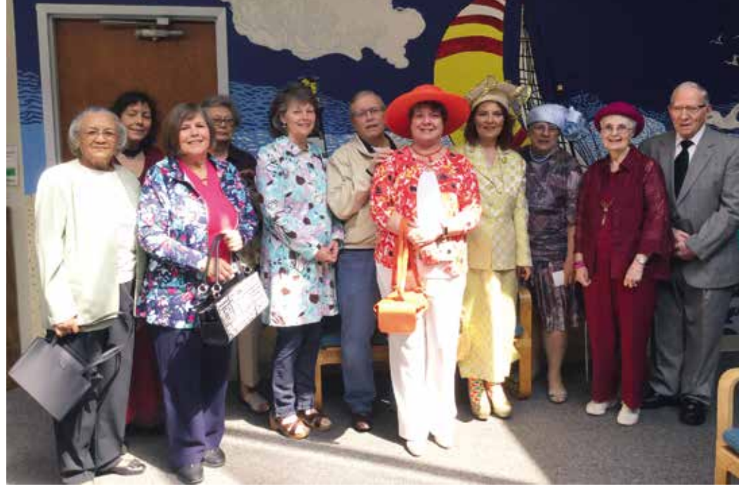
Encore and Erie County Senior Center volunteers participated in the Razzle Dazzle fashion show in April.