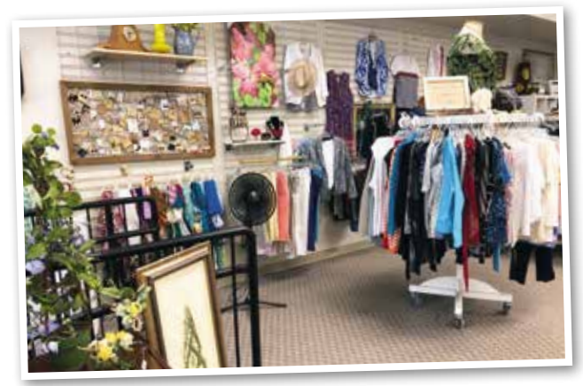
Donations accepted at the shop Tuesday through Saturday 11 a.m. to 3 p.m. Please use back door (behind Daly's) for larger donations