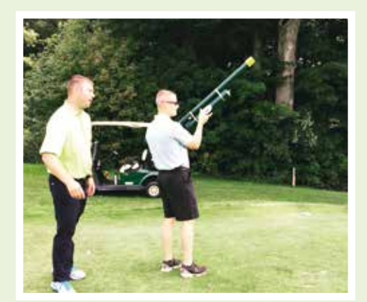
Stein Hospice Charity Golf Classic Eagle Creek Golf Club _ August 28