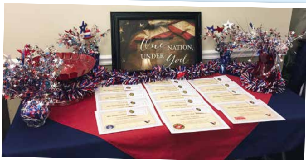
Veteran display at Clyde Gardens.