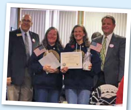
Genoa Senior Center Twin sisters being honored together for serving our country.