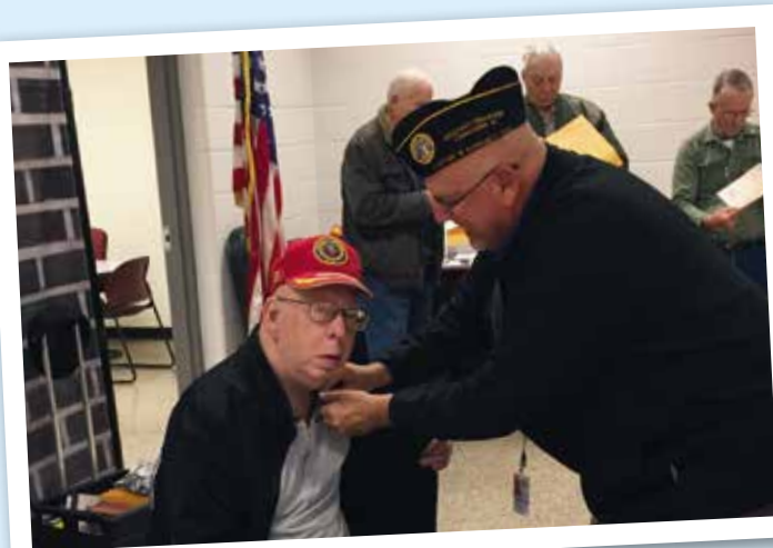
Veteran honored at Fremont Senior Center