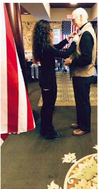
Veteran honored at Willows at Willard ceremony.