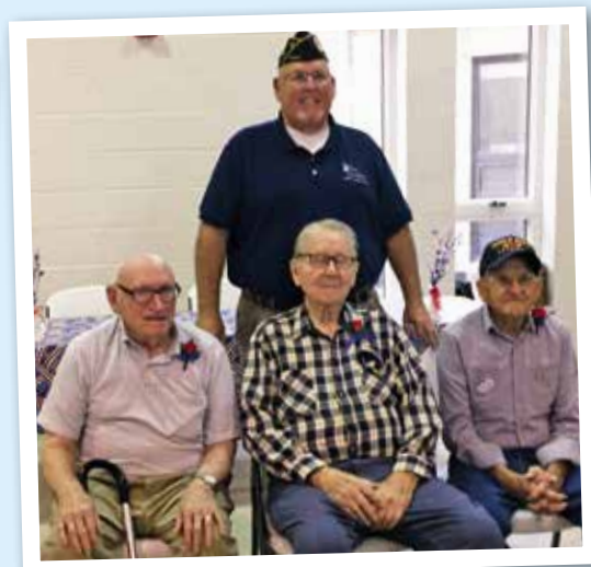
Elmore Senior Center WWII Veterans.