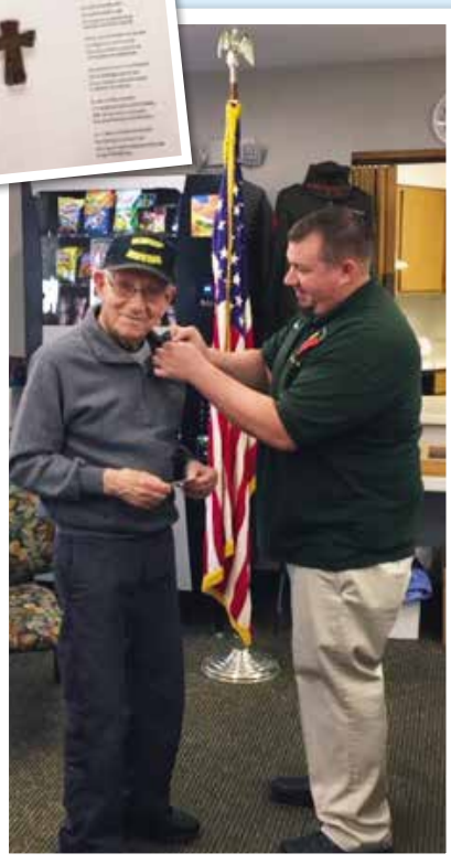
Gibsonburg Senior Center A 97 years young WWII Veteran who hand- carves crosses to share with everyone.