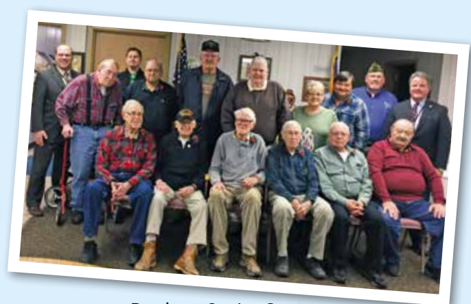
Danbury Senior Center Three WWII veterans and six Vietnam Veterans were honored.