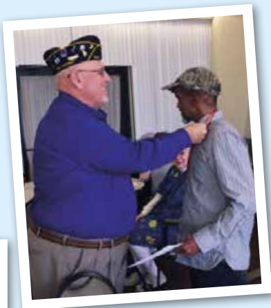
View Point Apartments Veterans being honored.